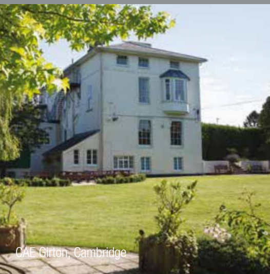
CAE Girton, Cambridge