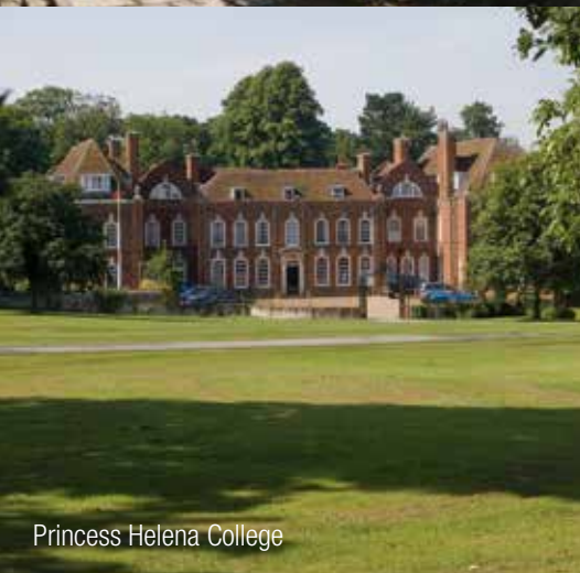
Princess Helena College