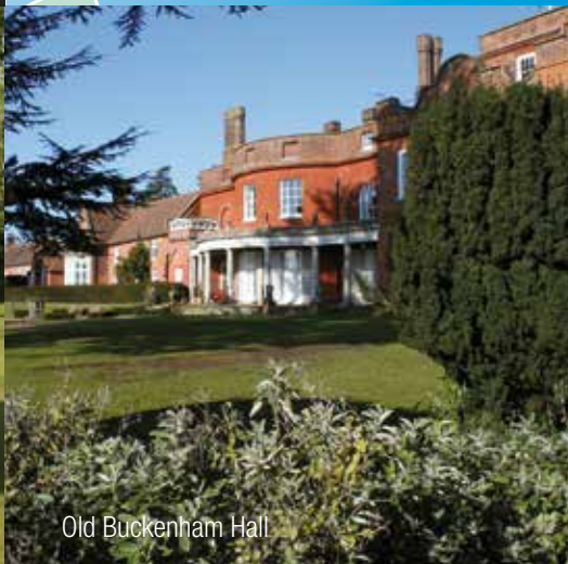
Old Buckenham Hall